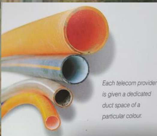
Each telecom provider is given a dedicated duct space of a particular colour.

Local Cable TV Operator and Broadband Service Providers like Octagon Broadband service, Tele-2-VisionCable & Broadband Service, Insat (II) Cable TV, Hitech Visual Channel Private Limited etc.