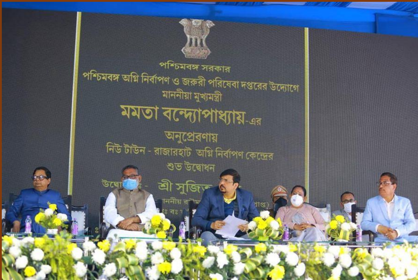
Inauguration of the first fire station of New Town