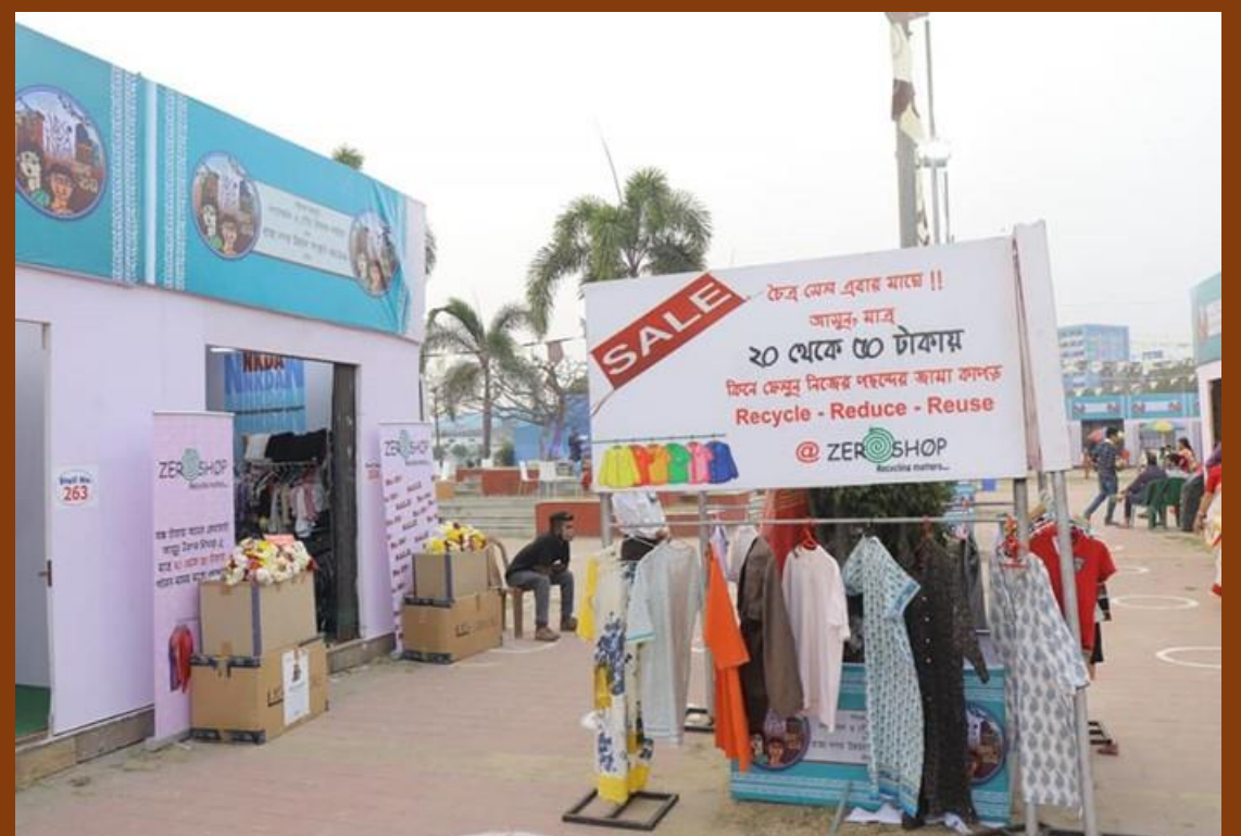
Some snippets of the Zero Shop stall at Swayamsidhha Mela