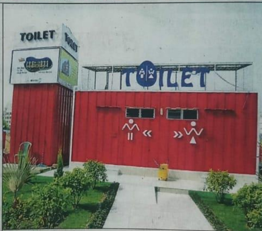
A newly built cargo container toilet in New Town

> New Town Smart Plaza, inside NKDA bus terminus near Pride Hotel, inside PHE tank No. 1, opposite Sonar Kella park, opposite Chittaranjan Cancer Hospital, behind Central Mall, in front of Candor Tech Space, near NBCC Complex and near Restello Building