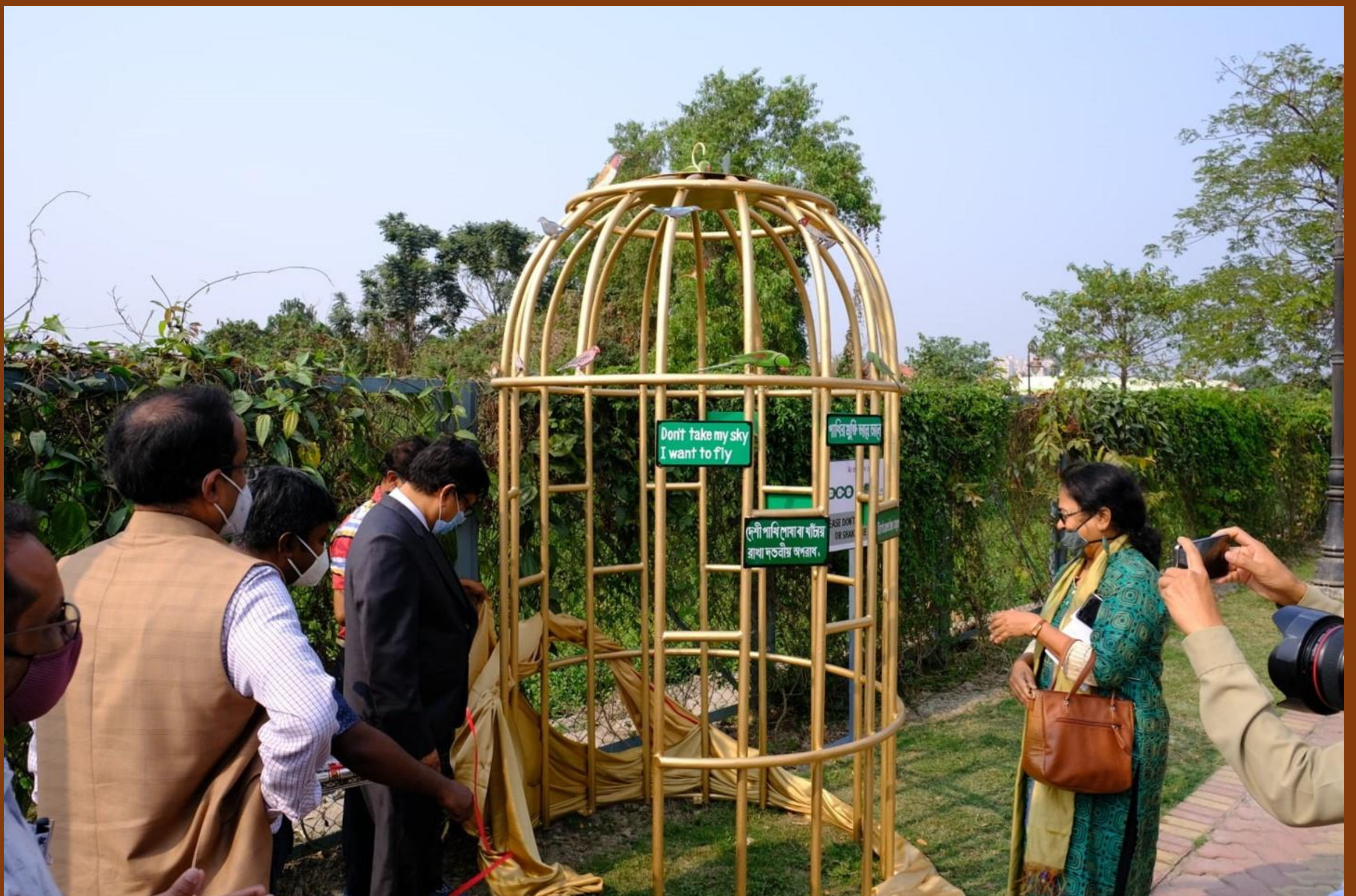
Hon'ble Chairman unveiling the promotional tool reinforcing non-caging of wild birds

The event started with the unveiling of a promotional tool reinforcing non-caging of wild birds by Hon'ble Chairman, followed by releasing of caged birds and butterflies in their natural habitat. The workshop was an insightful one, which explored easy steps to identify birds as well as helped the participants get acquainted with the local birds at Eco Park.