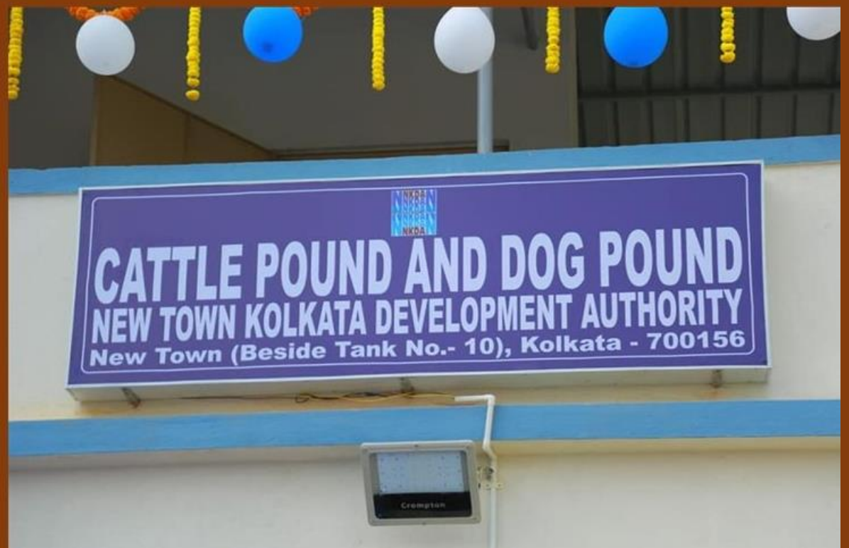
Hon'ble Chairman and CEO NKDA inaugurating the dog pound