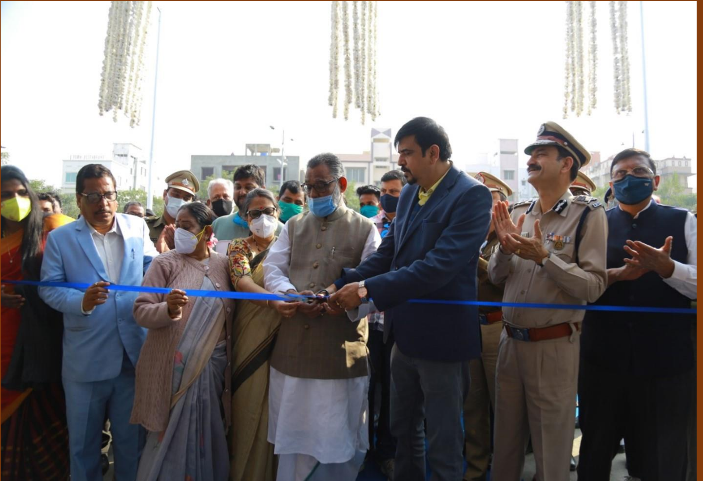
Hon'ble Minister Shri Sujit Bose, Hon'ble Minister Shri Purnendu Basu, and BMC Mayor, Smt Krishna Chakraborty cutting the inaugural ribbon

Also present at the event were Hon'ble Minister, Shri Purnendu Basu and Mayor of Bidhannagar Municipal Corporation, Smt Krishna Chakraborty as honorable guests. Previously, New Town was dependent on Bidhannagar for emergency services. But with its own fire and emergency services station being established, New Town's external dependencies for addressing emergencies has been diminished.