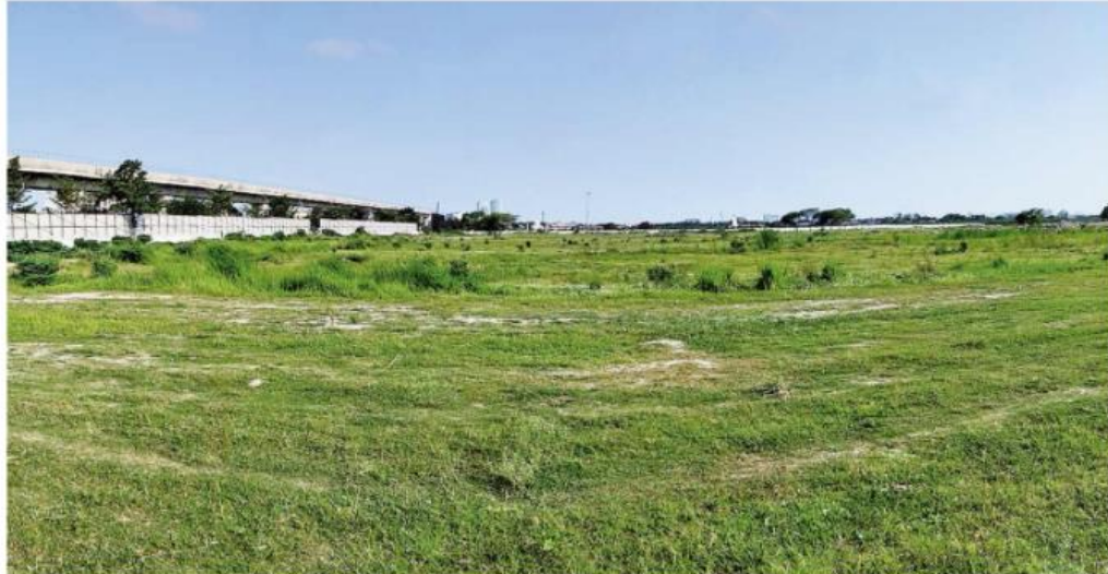
New Town's Silicon Valley Hub near Eco Park.

The area that has been named Bengal Silicon Valley covers over 200 acres and has 169 acre of allotable space