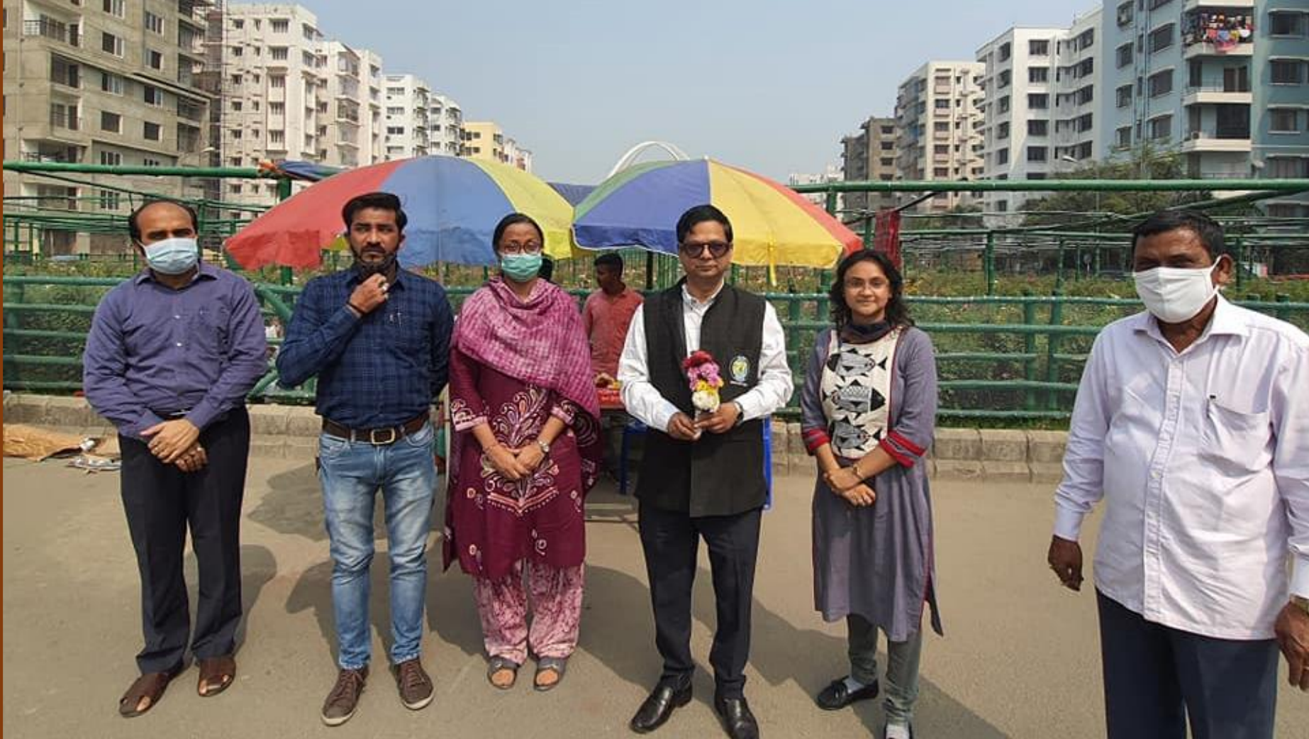
Hon'ble Chairman at the site where chrysanthemums were grown

In a unique urban floriculture endeavour, New Town city authorities are growing chrysanthemums and tube-rose on the road median of about 2-acre area near Biswa Bangla Gate at Narkelbagal crossing. The chrysanthemums were grown using grow light. These flowers had been sold through 8 counters at prominent locations across the city. The counters were opened on 14 th February 2021.