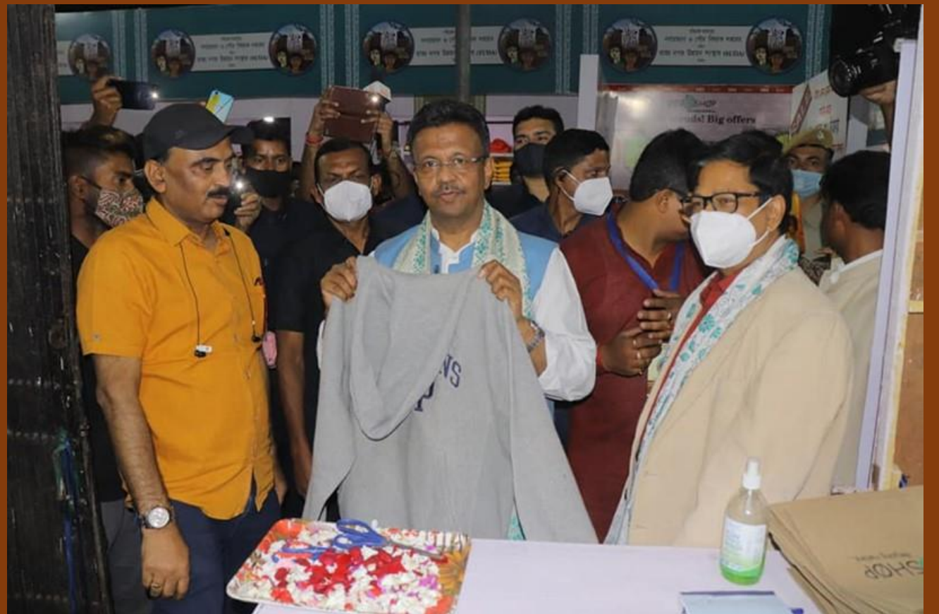
Hon'ble Minister, Mr Firhad Hakim inaugurating the Zero Shop stall at Swayamsidhha Mela