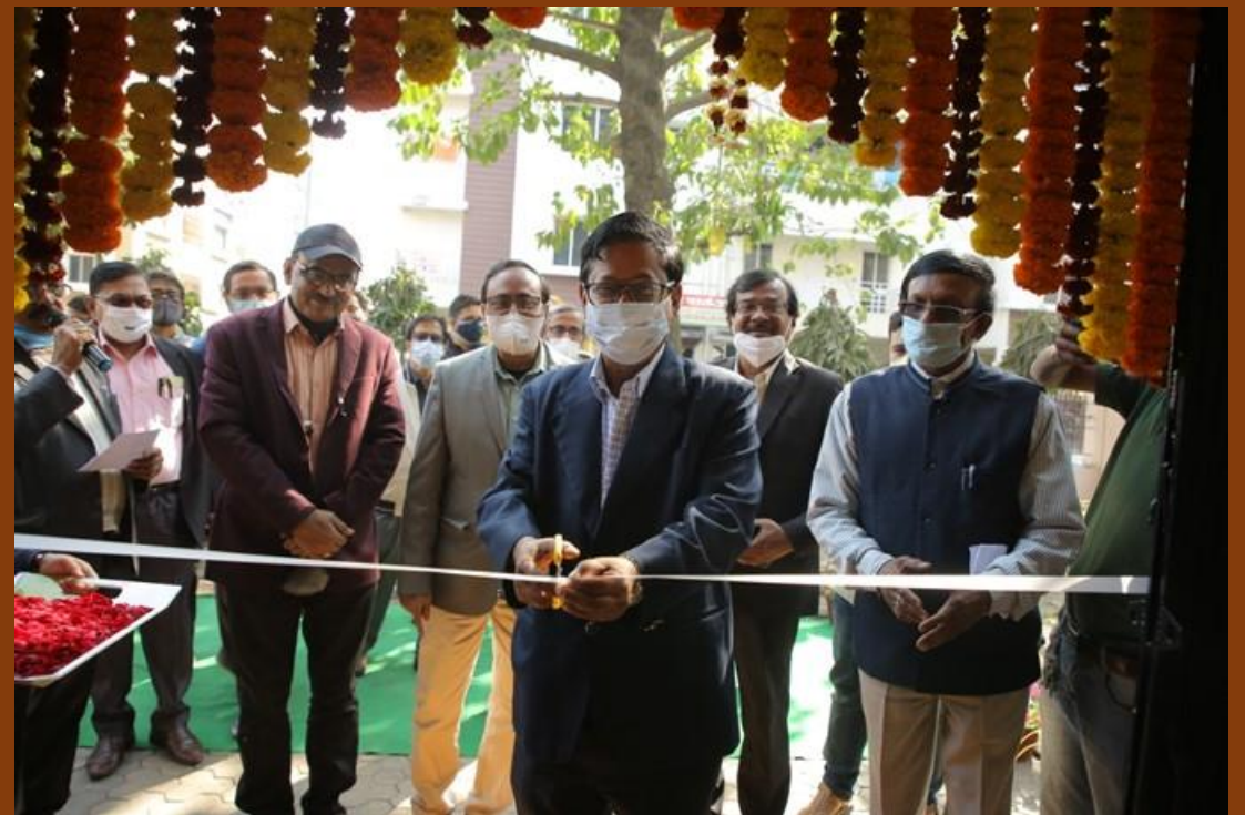
Hon'ble Chairman, inaugurating the FPS counter

The new Fair Price Shop will distribute subsidized rations to Ration Card holders having income below fifteen thousand rupees. Since New Town has a large floating population and is also surrounded by several villages and panchayat areas, the Fair Price Shop is a much-needed facility in the township. The FPS is open every Tuesday from 10AM to 2PM