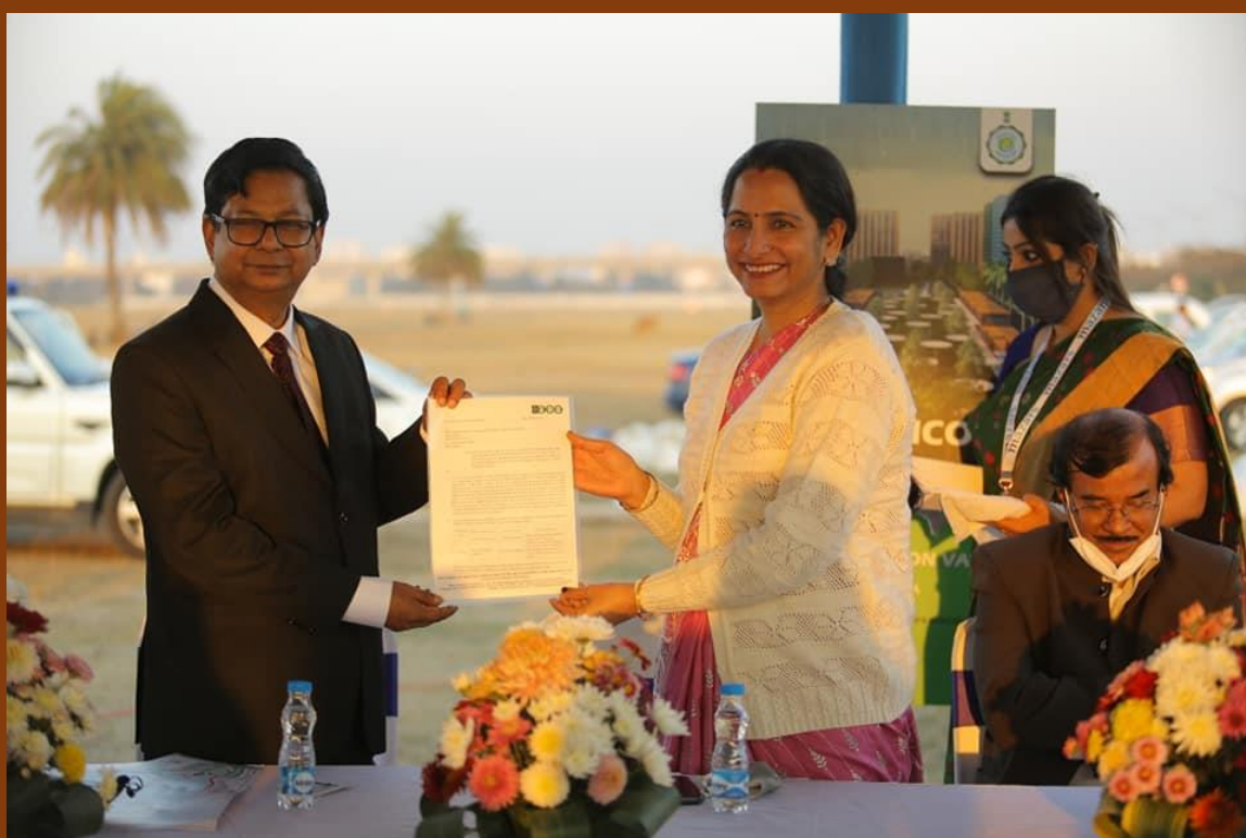
Allotment letters being handed over to the representatives of the organizations who were allotted Bengal Silicon Valley plots