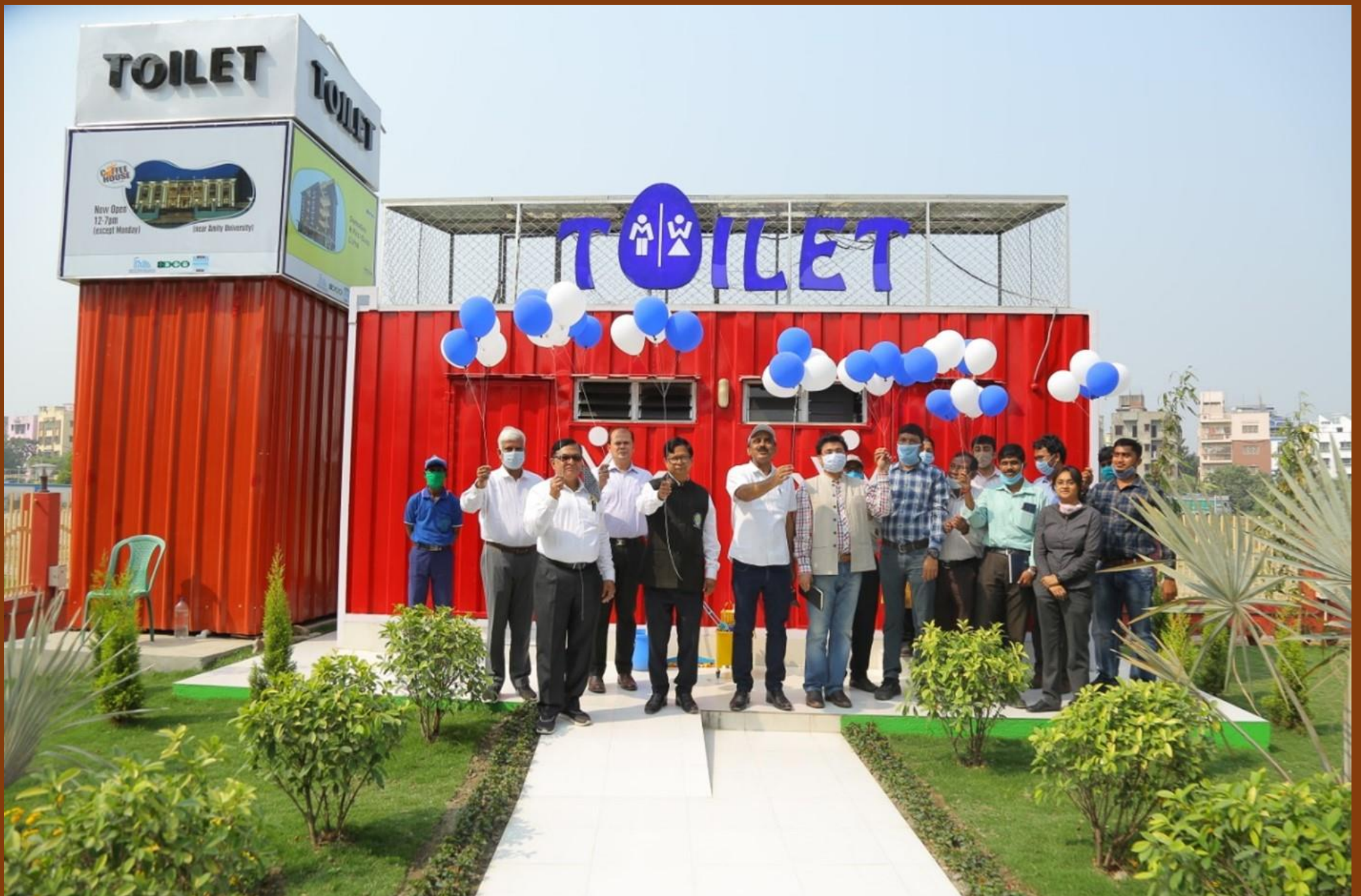
Hon'ble Chairman, along with the officials, inaugurating a containerized toilet