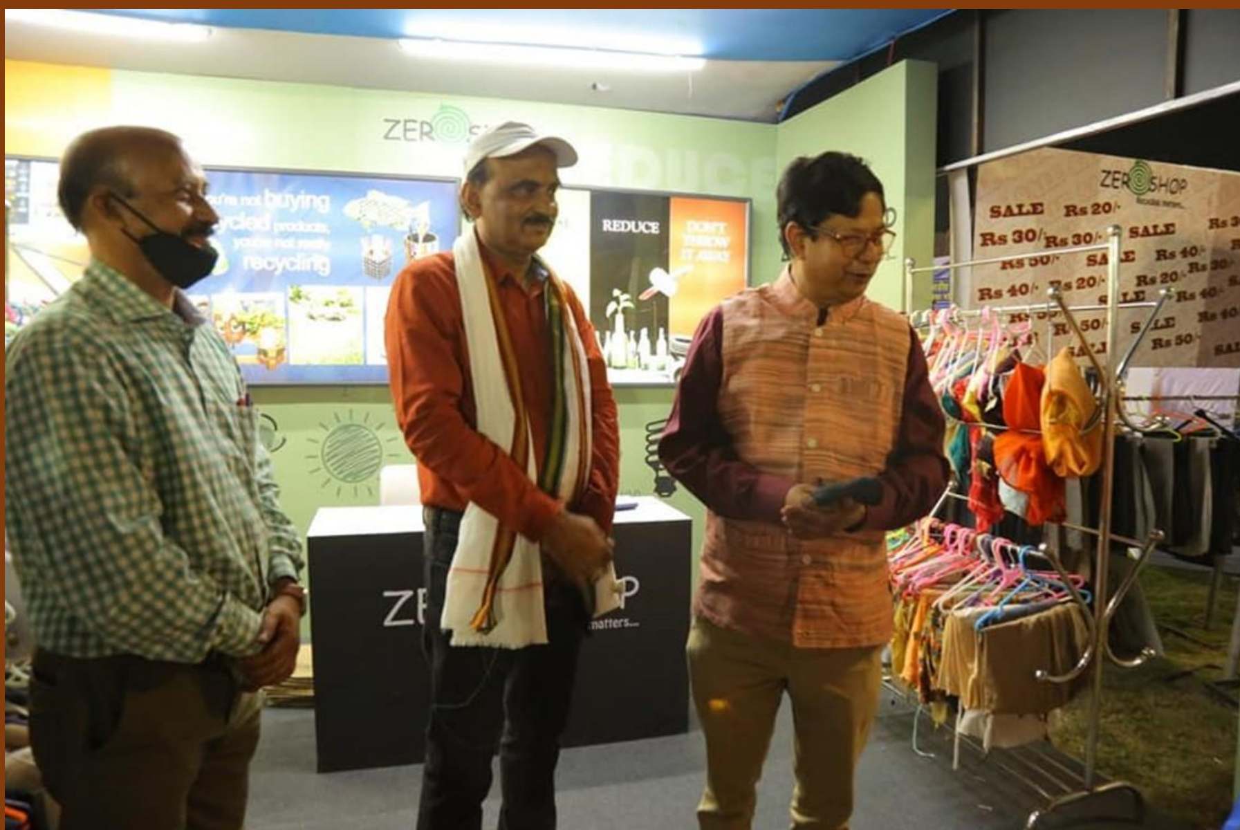
Hon'ble Chairman and CEO NKDA at the Zero Shop stall at New Town Book Fair