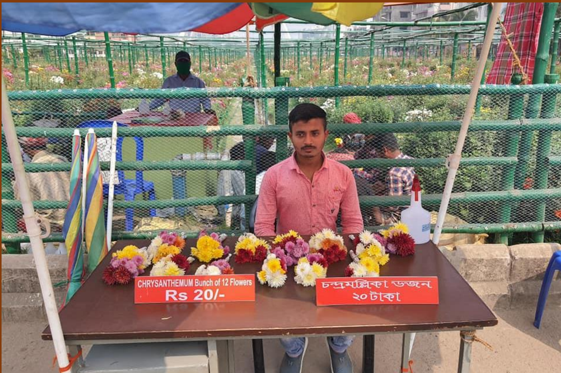
One of the flower counters