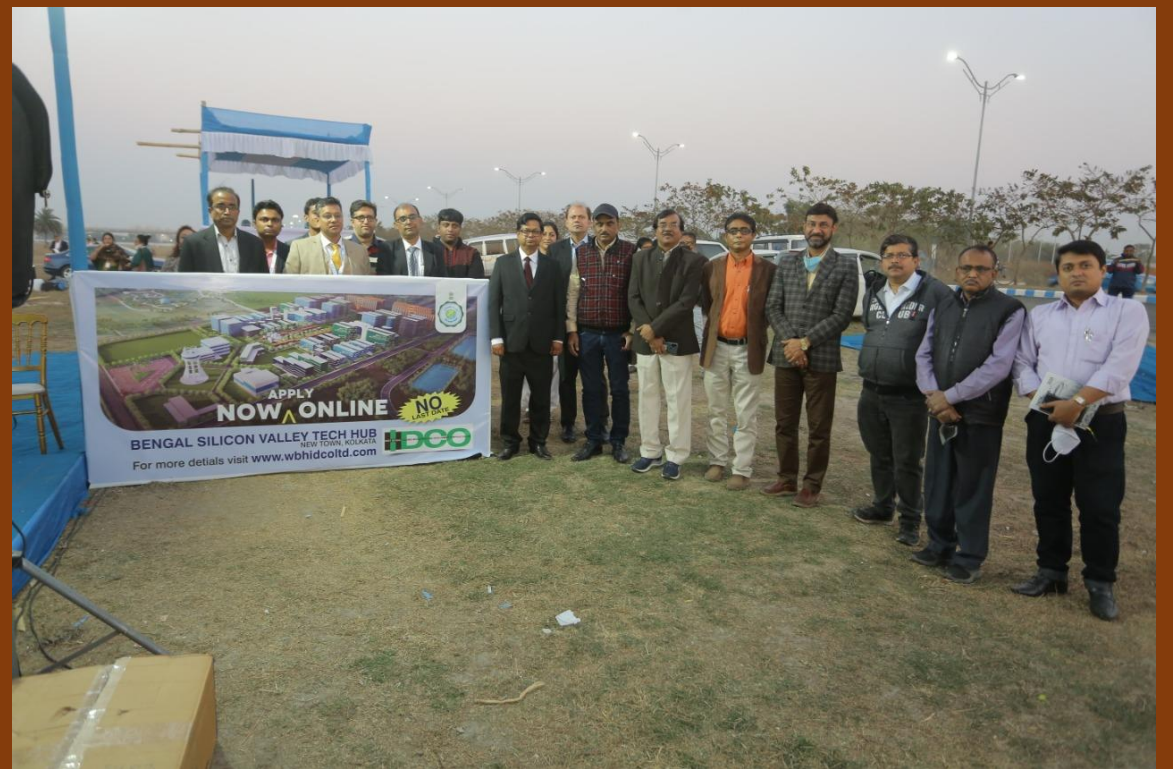
Hon'ble Chairman along with the officials of New Town Kolkata city authorities