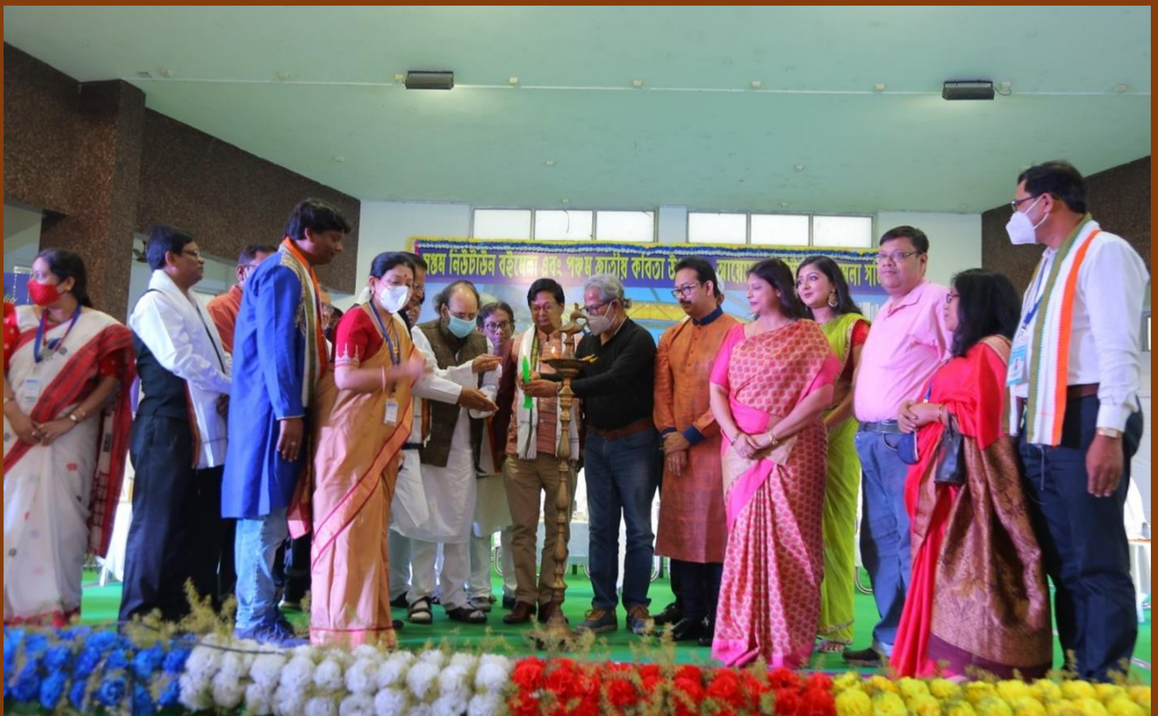
Few captures from the inauguration of New Town Book Fair