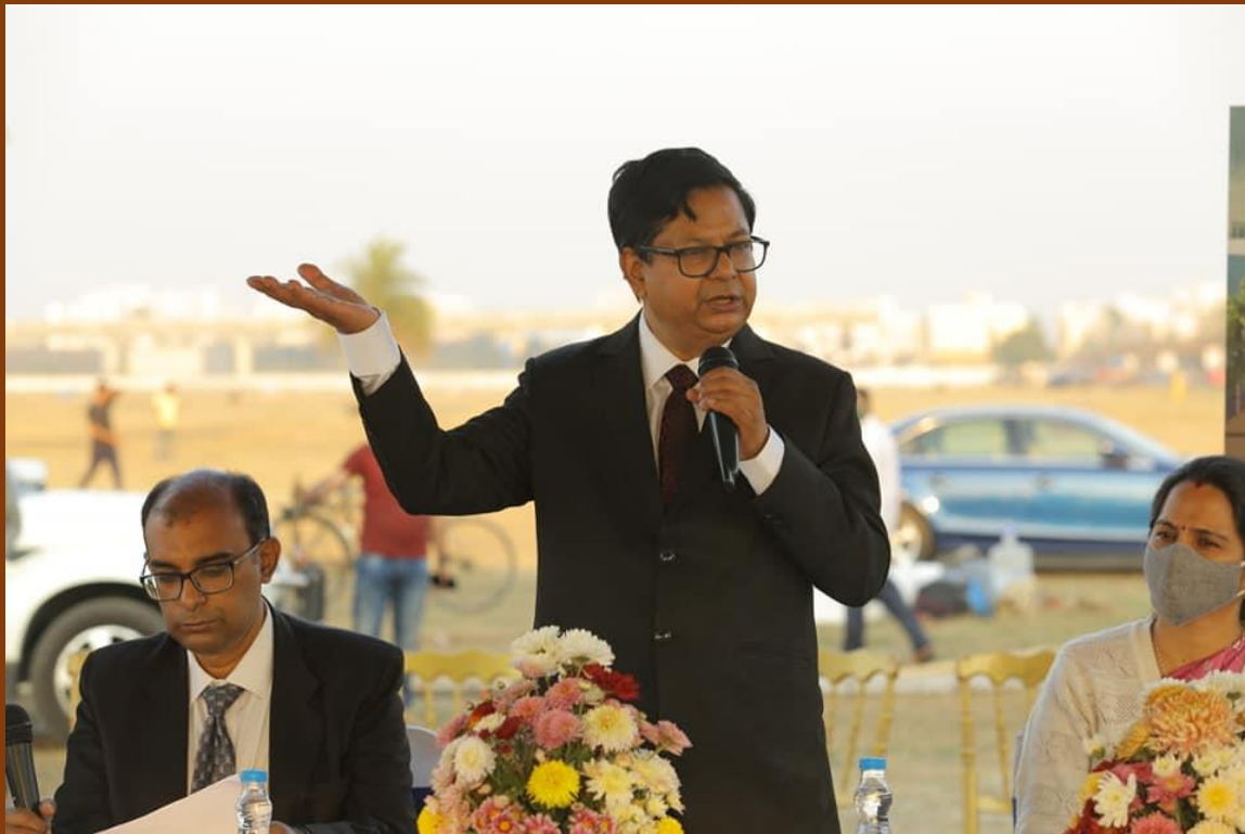
Hon'ble Chairman addressing all present at the event

Also, it was informed at the event that all the remaining plots for Bengal Silicon Valley shall be exhibited online and all applications would be done online.