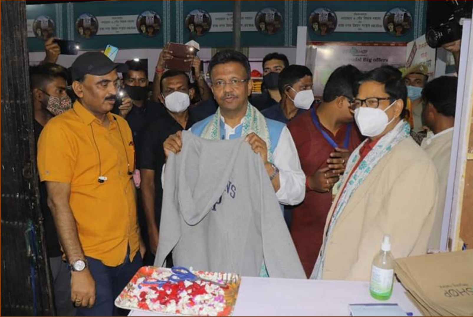
Zero Shop – New Town’s commitment to sustainability and recycling; Hon’ble Minister, Mr Firhad Hakim inaugurating a Zero Shop stall at Swayamsiddha Mela