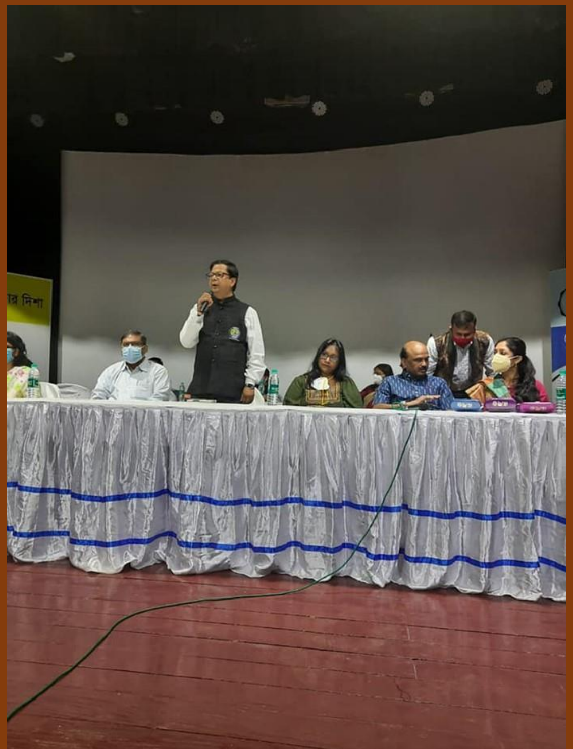
Some snippets from the Chokher Alo camp at Rabindra Tirtha