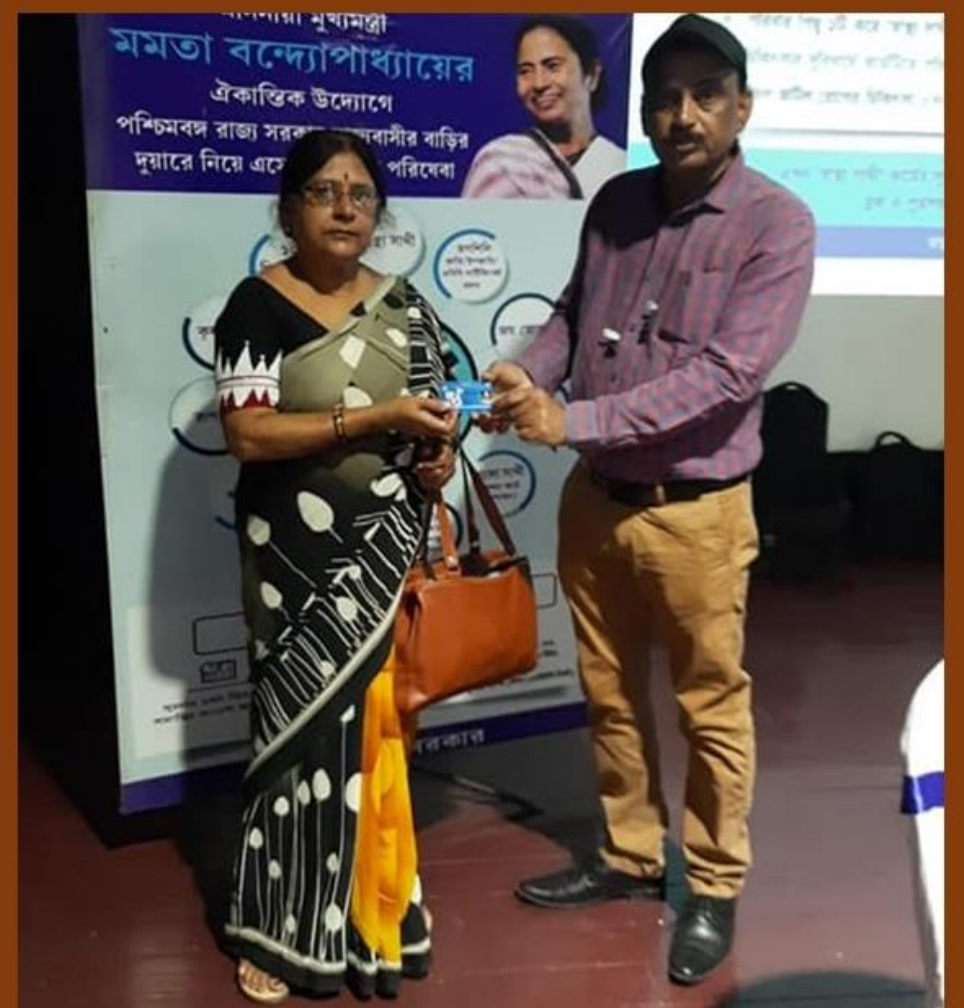
Snippets from the Swastha Sathi card distribution camps at Rabindra Tirtha in February 2021