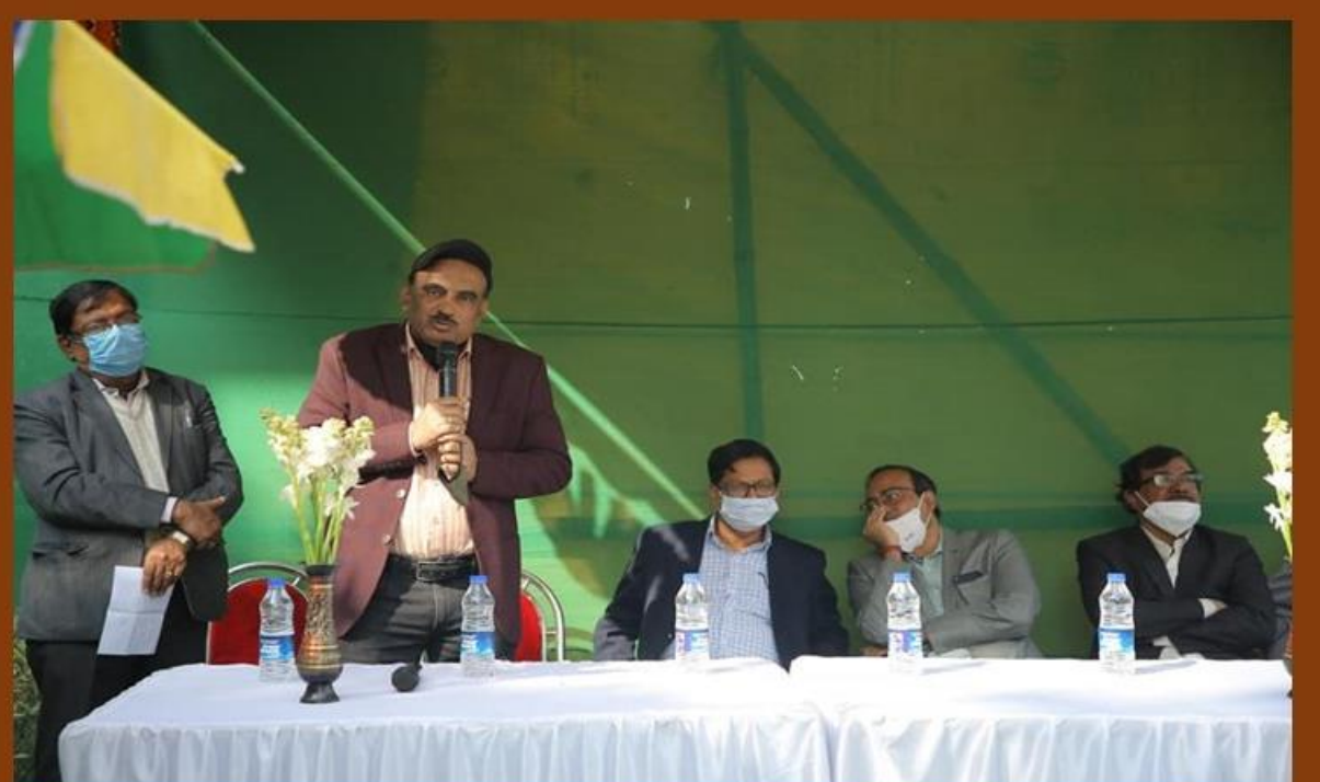
Some snippets from the FPS inauguration ceremony