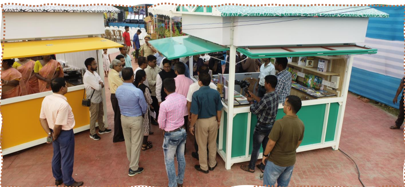
Inauguration of the Book Club by the City Officials

The location, though strategically positioned, was grappling with encroachments that had taken root. The lack of proper lighting cast a shadow over the area, giving rise to unsocial activities that tainted its reputation. However, amidst these challenges, a beacon of community connection was already in place – a bikers' café that attracted patrons who found solace in this informal hangout zone. As the site is also located in between two buzzing places of the city, namely City Center II & Eco Park, it benefits from a high number of daily footfalls from in and around and even from the outside of the city.